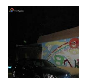
With white light